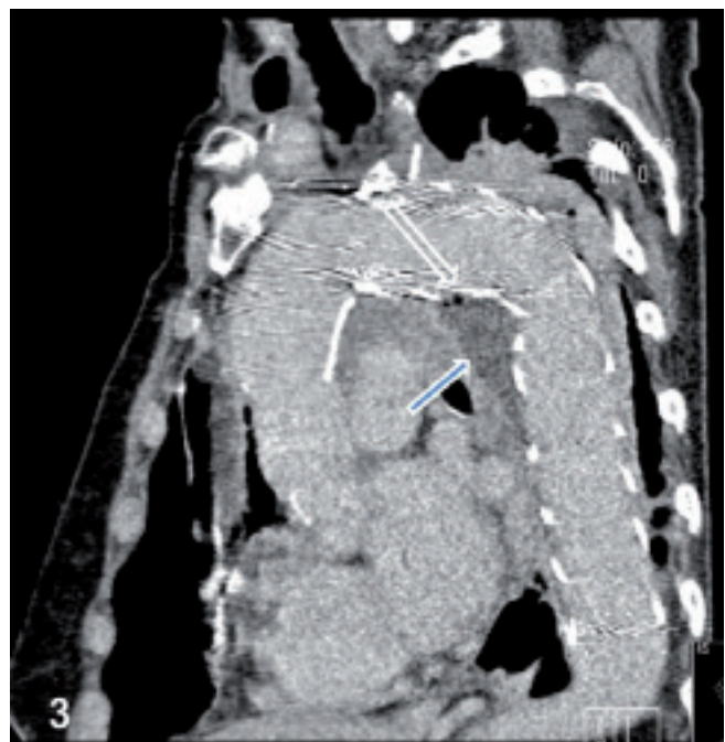
Figure 3. Computed tomography scan showing the stent graft surrounded by infected soft tissue (arrow) with air bubbles (outlined arrow) in the distal aortic arch and proximal descending thoracic aorta.